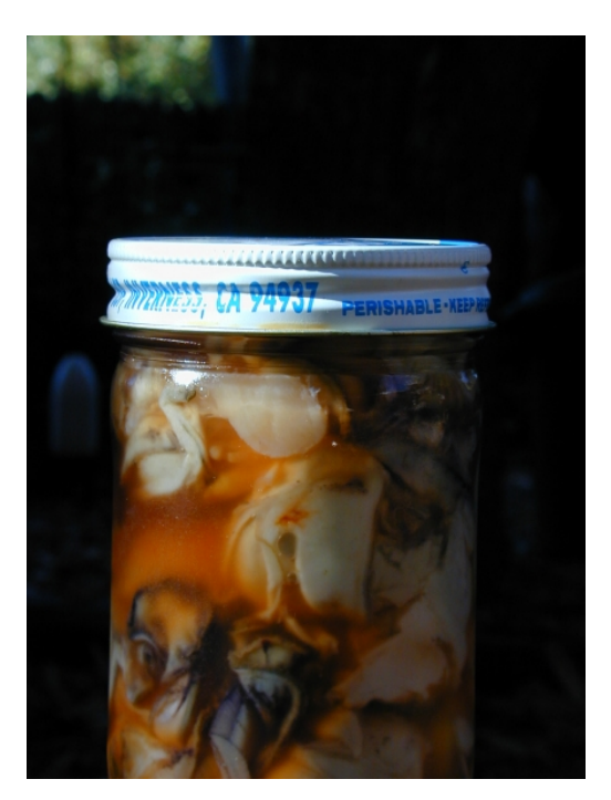
Figure 2. Jar of oysters that were harvested from a red tide.