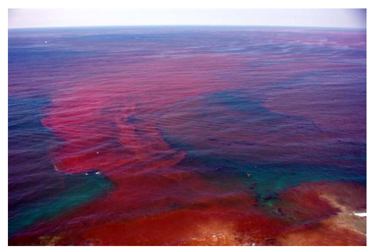
Figure. 1. Red Tide in San Diego, CA (2001).

In simplest terms, a red tide is a "bloom" of phytoplankton. Phytoplankton are microscopic, single-celled plants that occur naturally in our coastal waters. A "bloom" occurs when a particular species of phytoplankton begins reproducing rapidly and results in millions of cells in each gallon of water. Not all phytoplankton species produce visible blooms. Red tides are caused by a particular group of phytoplankton called dinoflagellates which seem to prefer warmer and calmer waters.